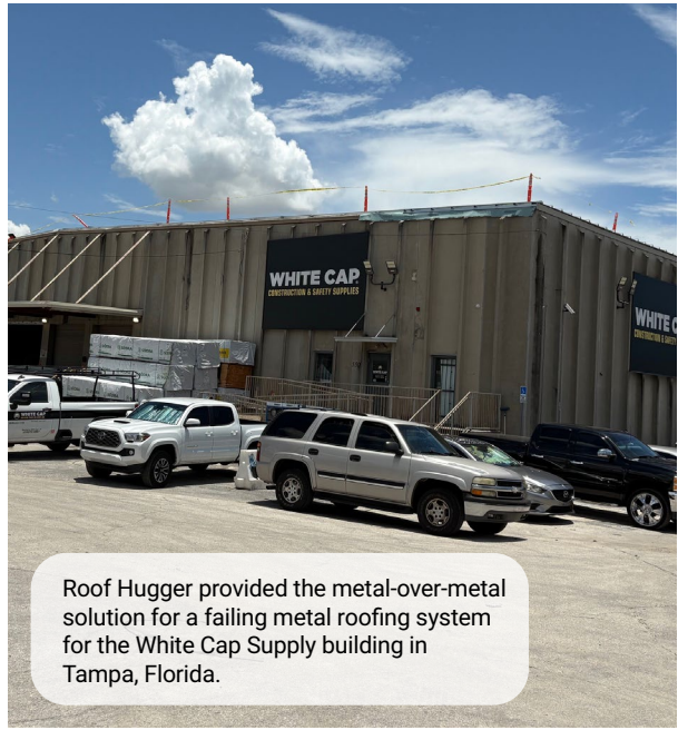
Roof Hugger provided the metal-over-metal solution for a failing metal roofing system for the White Cap Supply building in Tampa, Florida.