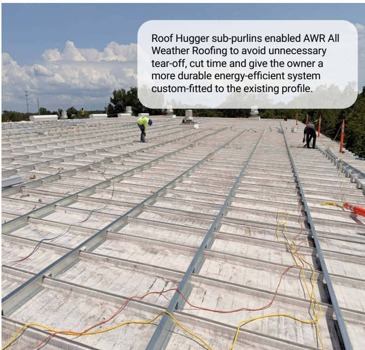
Roof Hugger sub-purlins enabled AWR All Weather Roofing to avoid unnecessary tear-off, cut time and give the owner a more durable energy-efficient system custom-fitted to the existing profile.