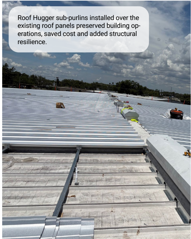
Roof Hugger sub-purlins installed over the existing roof panels preserved building operations, saved cost and added structural resilience.

WHITE CAP SUPPLY stores operate 10 hours a day, serving contractors who depend on uninterrupted access to materials. When the Tampa, Florida, location needed a new roof, shutting down for weeks wasn't an option.