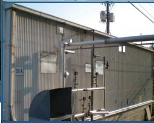
Inset: Before Paramount's involvement, the south side of this building at Oak Ridge National Laboratory was thermally inefficient with a number of penetrations. Main photo: After Paramount completed the retrofit, the thermal efficiency sharply increased.