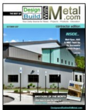
October 2017 Contractor Edition