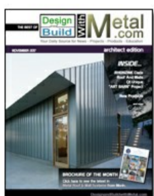
November 2017 Architect Edition