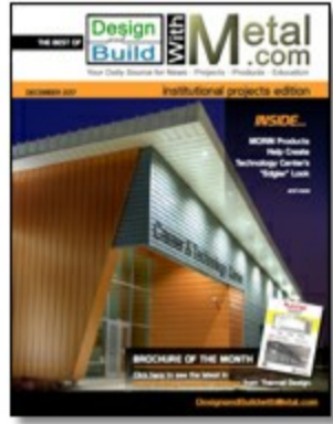
December 2017 Institutional Projects Edition